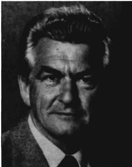
Bob Hawke is uncaring

The more homos that enter Australia, the more Australians will get AIDS. Prime Minister Bob Hawke could care less. He and his pack of race-crunching pols and money-men don't want upstanding immigrants, they want nonwhites in order to turn Australia brown. If these egalitarian politicians get AIDS -- which, because of their yen for nonstandard lifestyles, they stand a much better chance of catching than the ordinary Aussie -- they may have cause (too late, of course) to regret their plague-threatening immigration policies.